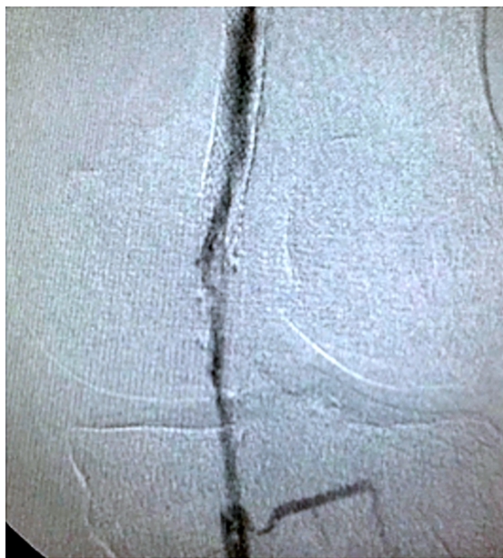
Figure 1. Pretreatment arteriography showing in-stent restenosis of approximately 85% at the most critical point, at the femoropopliteal transition.

A retrospective analysis was conducted of the medical records of a cohort of patients who had been treated with percutaneous transluminal angioplasty of femoropopliteal segments between 2012 and